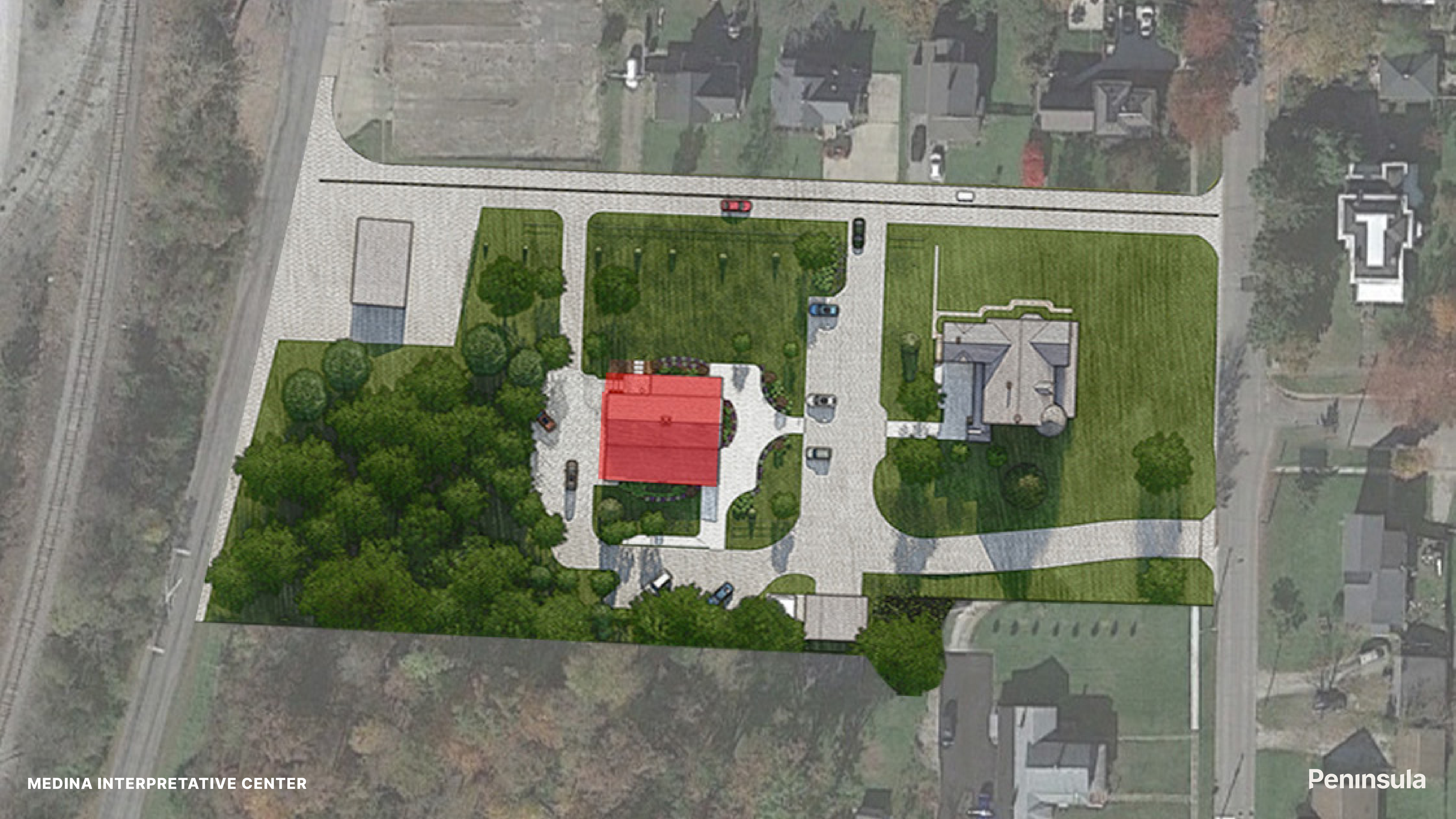
MEDINA INTERPRETATIVE CENTER