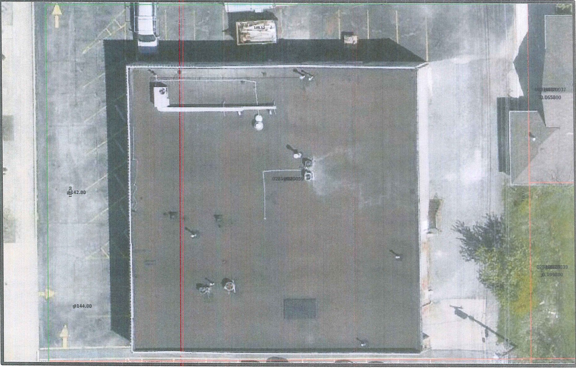
Generated with the GeoMOOSE Printing Utilities